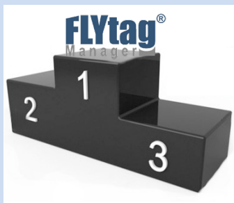
2011 RFIDlab benchmark FLYtag® rank #1